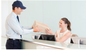
Transportation & Logistics